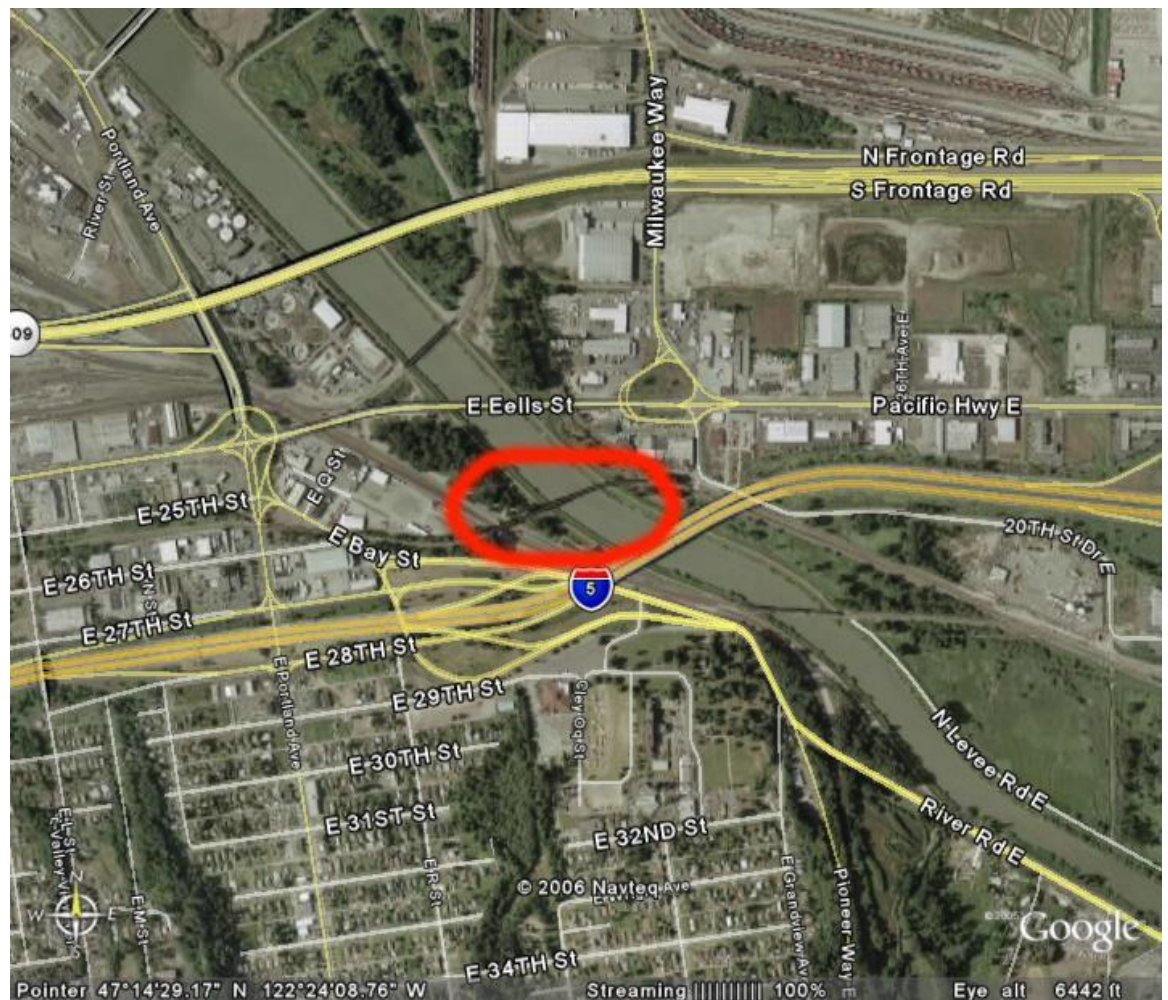
Location over the Puyallup River

Bridges are constructed to flex under extreme loads and earth tremors. The girder bearings on the bridges are frozen with rust and would not flex properly in the event of a significant earthquake. There is the possibility of a major failure of either or both bridges.